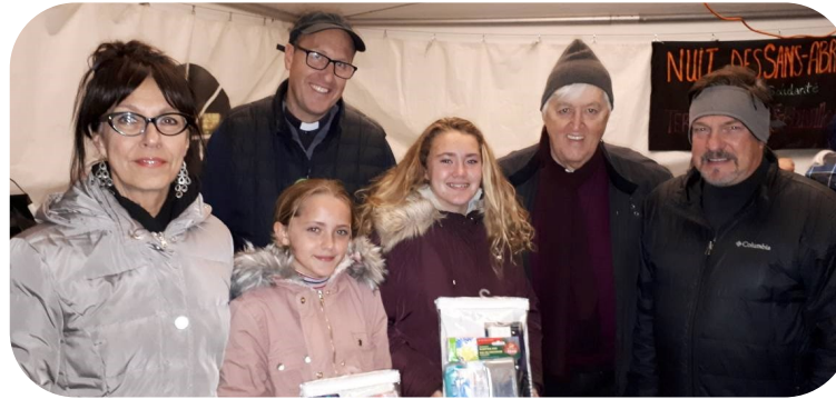
The 2019-2020 Annual Campaign brought in $214,926